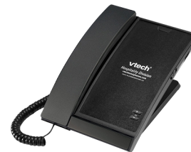
Contemporary SIP 1-Line Corded Lobby Phone | S2100-L