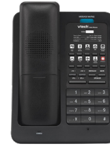
Color SIP 2-Line Cordless Phone LS-S3420