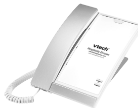
Contemporary SIP 1-Line Corded Lobby Phone | S2100