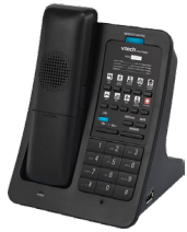
Color SIP 1-Line Cordless Phone LS-S3410